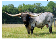
HL Heads Up