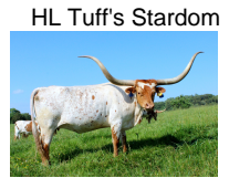
HL Tuff's Stardom