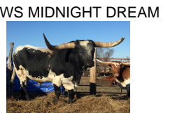
WS MIDNIGHT DREAM