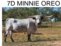
7D MINNIE OREO