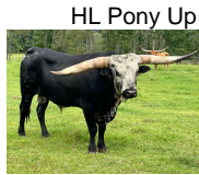
HL Pony Up