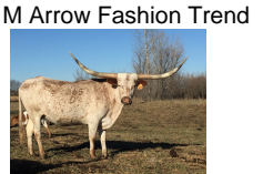
M Arrow Fashion Trend