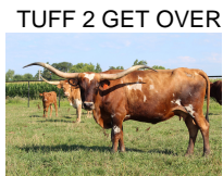
TUFF 2 GET OVER