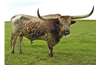
Whelming Daisy Mae